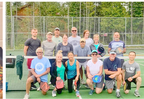
CLARK TOWNSHIP / SNOWS HERITAGE PARK