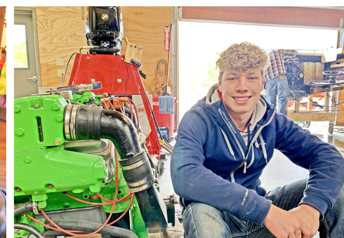
GREAT LAKES BOAT BUILDING SCHOOL