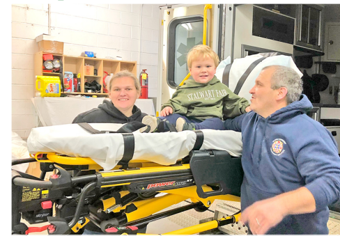
LES CHENEAUX AMBULANCE AUXILIARY

Please consider supporting the Les Cheneaux Community Foundation and the other worthy organizations. Your contributions helped make all of this possible for our communities.