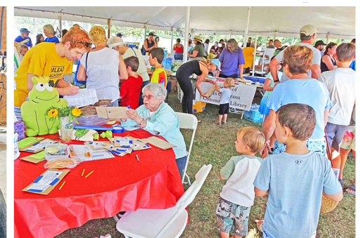
LES CHENEAUX WATERSHED COUNCIL