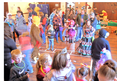
HESSEL SCHOOL HOUSE & AVERY ARTS CENTER