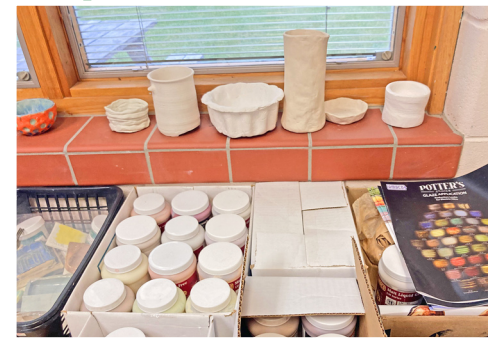
LES CHENEAUX EDUCATION FOUNDATION