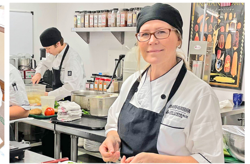
LES CHENEAUX CULINARY SCHOOL