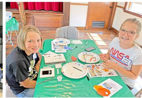
LES CHENEAUX ARTS COUNCIL